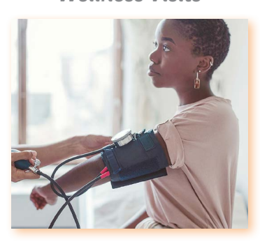
The Importance of Wellness Visits